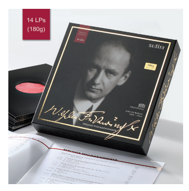
Wilhelm Furtwängler Berliner Philharmoniker