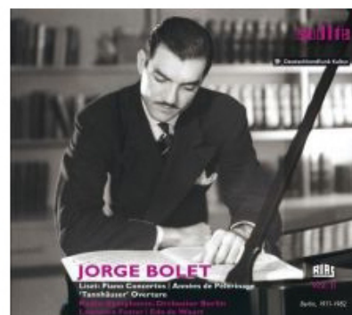
LISZT RIAS Recordings, Vol 2

The three Petrarch Sonnets provide an introspective interlude not markedly different from Bolet's later account for Decca (6/84) in his recording of the second book of Années de pèlerinage . The Wagner-Liszt Tannhäuser Overture was one of Bolet's specialities. This astonishing studio recording (RIAS Funkhaus, Berlin) was made in October 1973, three months after his RCA recording (not released until 2001) and four months before the unforgettable performance of February 1974 in the legendary Carnegie Hall recital that established him as one of the all-time greats. The command of structure, the judicious pacing and unleashing of those final torrential octaves under the main theme send shivers up the spine.