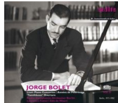
LISZT RIAS Recordings, Vol 2

The three Petrarch Sonnets provide an introspective interlude not markedly different from Bolet's later account for Decca (6/84) in his recording of the second book of Années de pèlerinage . The Wagner-Liszt Tannhäuser Overture was one of Bolet's specialities. This astonishing studio recording (RIAS Funkhaus, Berlin) was made in October 1973, three months after his RCA recording (not released until 2001) and four months before the unforgettable performance of February 1974 in the legendary Carnegie Hall recital that established him as one of the all-time greats. The command of structure, the judicious pacing and unleashing of those final torrential octaves under the main theme send shivers up the spine.